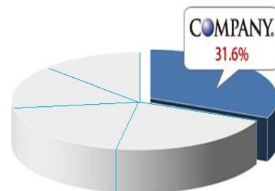
2011 年 ERP 软件包市场占有率